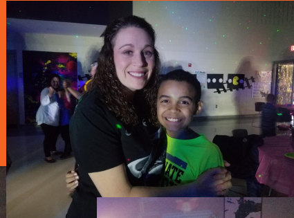
Mother/ Son Dance